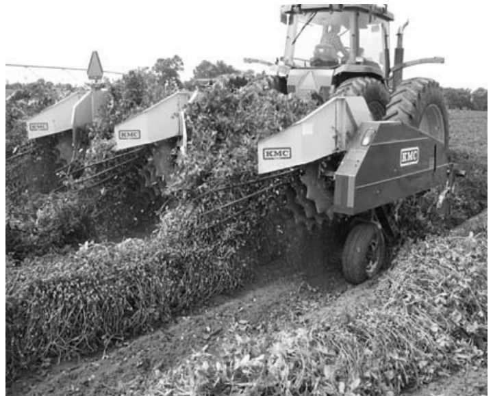
Farmers, including this peanut producer, can benefit from the creation of an environmental policy statement.

Companies and businesses often create policy statements that summarize the objectives and goals of that business and establish the criteria for meeting those objectives and goals. Your farm may or may not already have a policy or “mission” statement that summarizes your objectives and commitments. Many companies are now realizing the benefits of also drafting an “environmental” policy statement. You as a farmer may also benefit from this process. By drafting an environmental policy statement, you can begin to “flesh out” what is likely already understood and practiced on your farm, and also provide a framework for future improvement and resource conservation.